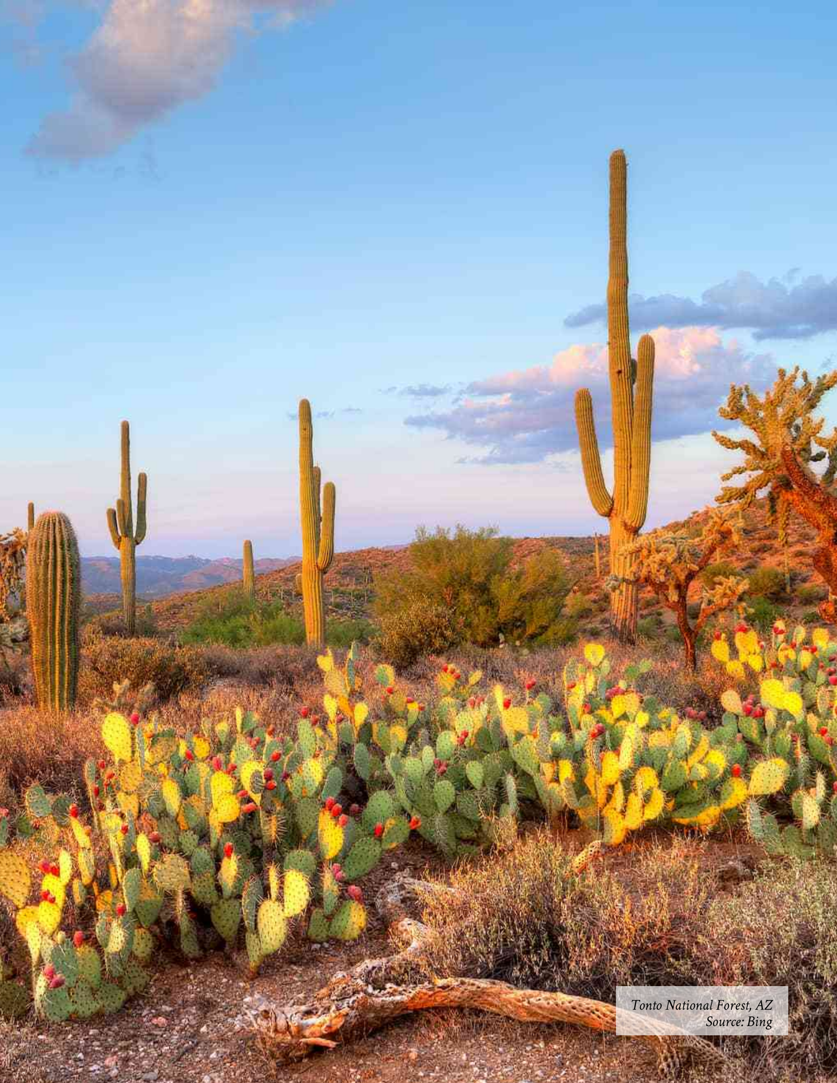
Tonto National Forest, AZ