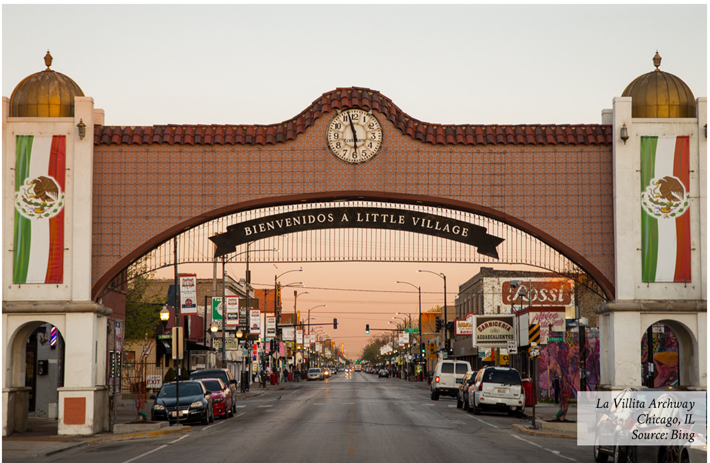
La Villita Archway Chicago, IL

Above all, interviewees stated the need for increased access to public lands for the Hispanic communities. Public lands ought to feel safe, welcoming, and open to all. Lack of Spanish translation and Hispanic American representation and the presence of uniformed rangers, discrimination from park staff and other recreators, card-only entrance fees and more, all prevent our public lands from being truly public . A shift in public land preservation and management processes can change how history is told through public lands and who is able to access and enjoy these lands, thus helping shape a more conscientious, just, and unified future.