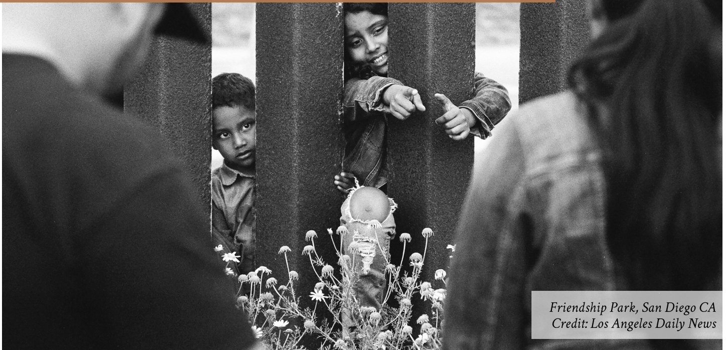
Friendship Park, San Diego CA